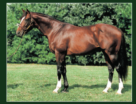
DISCO RICO | $5,000 Citidancer-Round It Off A consistent leading New York sire