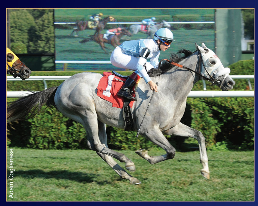
Just days after MAYBRY'S BOY's returned to Highcliff his first winner , SPORTSWRITER captured the ninth race at Saratoga on Aug. 5