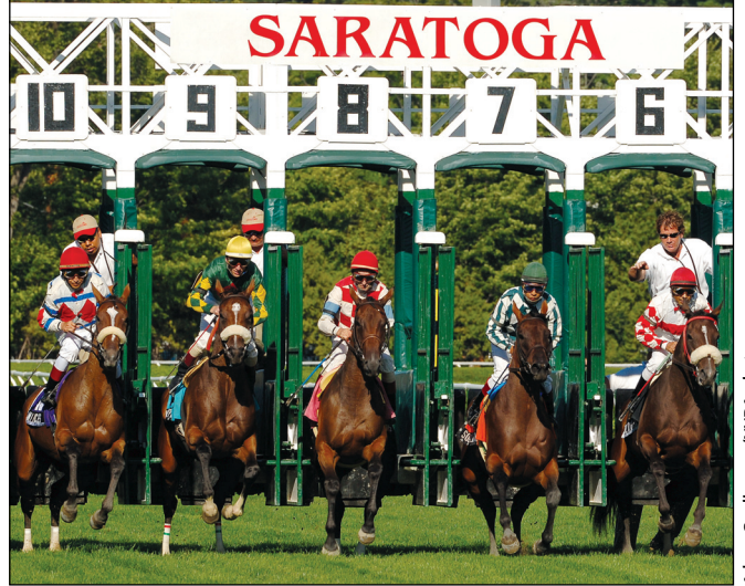
THEY'RE OFF Purses, field sizes increase, with more expected after opening of Aqueduct racino this fall

Saratoga never has been regarded as a claiming track, and it staged only 13 claiming races for New York-breds, all of them for maiden claimers. They averaged a healthy $30,438 per race, although they received less than 10% of all state-bred purses. They filled 15.7% of all state-bred races and averaged ten starters per race.