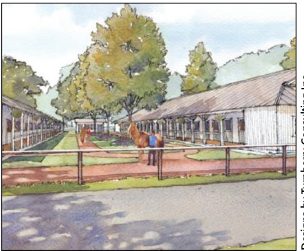
NO MORE STALLING Artist's rendering of new stalls on Saratoga backstretch

Potentially the largest undertaking would be a permanent At The Rail hospitality building to replace the current At The Rail tent and the luxury suites on the clubhouse turn. The three-story building would