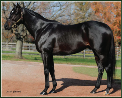
NOONMARK | $6,000 Unbridled's Song-In the Storm Graded Stakes Winner First foals arrived in 2011