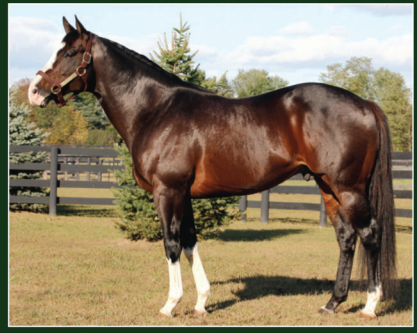
FREUD | $8,500 Storm Cat-Mariab's Storm Sire of 26 stakes winners, including GIANT RYAN-G2