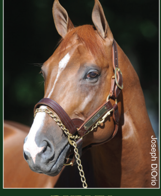
DUBLIN $8,500 Afleet Alex-Classy Mirage

We invite you to call for an appointment to come by and see all the stallions.