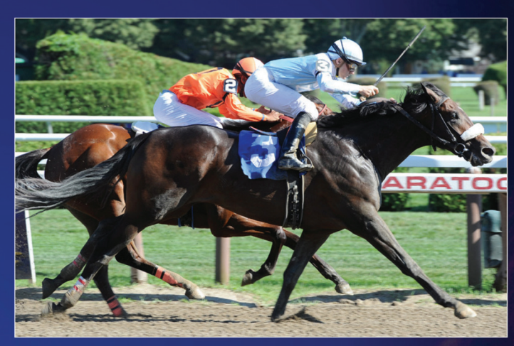
Two-year-old GOODTIME BOY got up late after an eventful trip to win at the Spa!

Flying Zee Stable's homebred GOODTIME BOY is one of nine first crop runners by Freshman Sire STONESIDER .