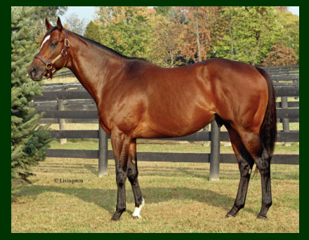
READ THE FOOTNOTES Smoke Glacken-Baydon Belle | $5,000