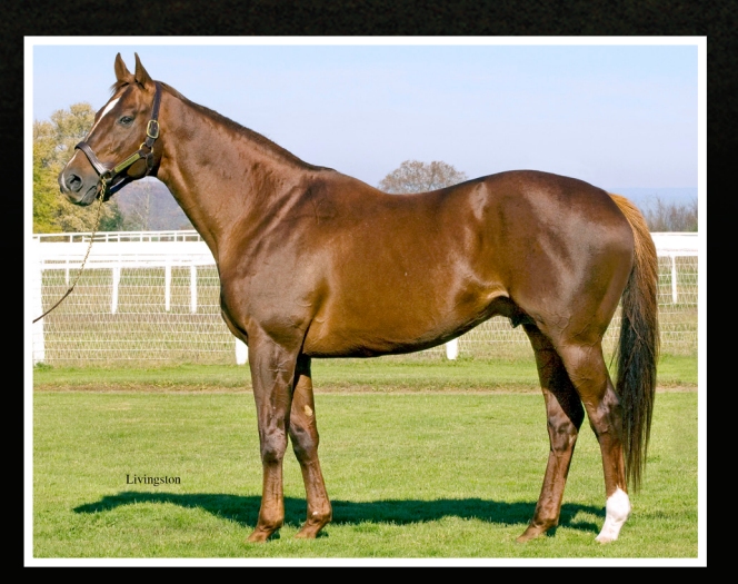
CONGAREE Arazi - Mari's Sheba | $7,500 #1 NY Sire of 2010 Graded Stakes Winners. #1 Yearling by a NY Sire, $95,000 filly KeeSept.

The #1 NY stud farm, #10 in the U.S., by percentage of graded stakes winners from 100 or more starters*, Highcliff is poised to take your program to the next level of success. We are committed to the NY racing and breeding program whose future has never been brighter. Call us today and learn how you can be a part of it .