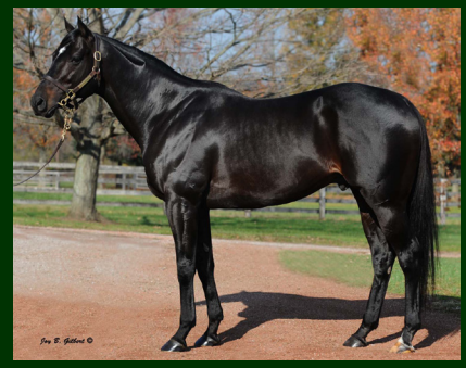
NOONMARK Unbridled's Song-In the Storm