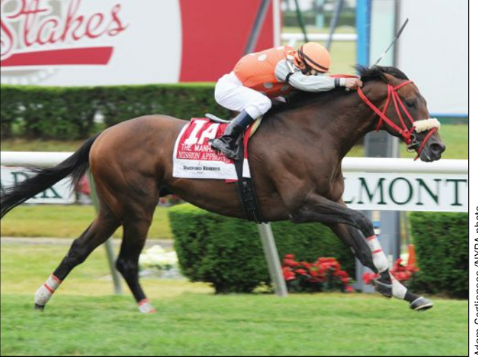
MISSION APPROVED WINNING THE MANHATTAN