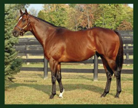
READ THE FOOTNOTES $6,500 Smoke Glacken-Baydon Belle

NOONMARK | $6,000 Unbridled's Song-In the Storm