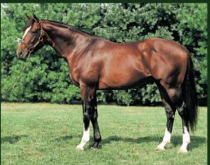
DISCO RICO | $5,000 Citidancer-Round It Off

For nearly a quarter of a century, KEANE STUD has provided a superior environment for stallions and broodmares in the Northeast.