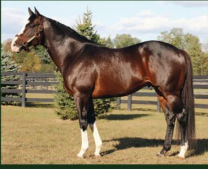
FREUD | $8,500 Storm Cat-Mariah's Storm