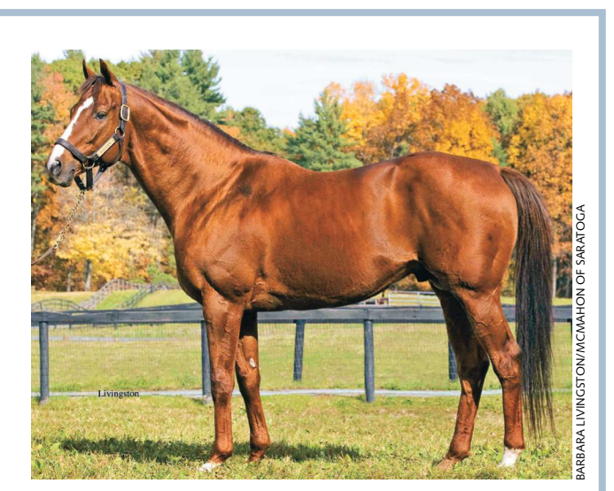
Utopia, by Forty Niner, is the sire of five stakes winners

Utopia will spend 30 days in quarantine at trainer Mu-