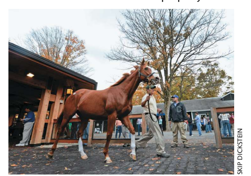
Fasig-Tipton Saratoga's fall mixed sale will take place Oct. 7