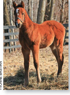
Heleonor Rugby colt