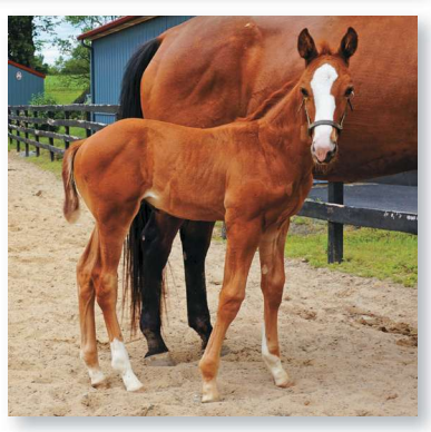
Summer Shenanigans colt