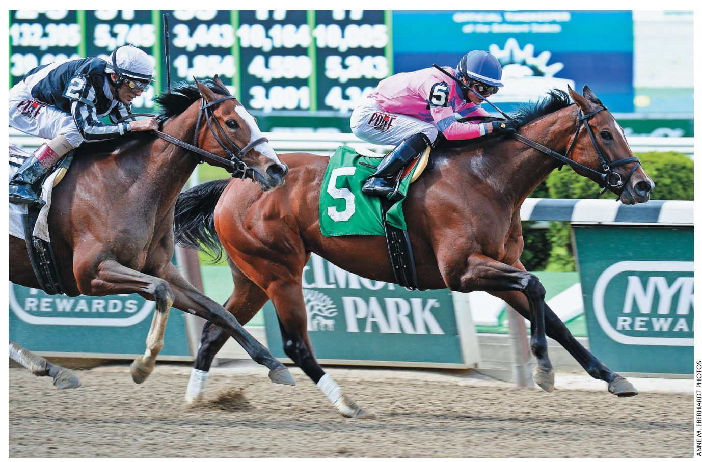
La Verdad defeats Hot Stones in Belmont's Critical Eye Stakes

shoulder during a riding mishap, she decided she might be better off owning horses than riding them, but marriage and motherhood intervened and the dream of owning a Thoroughbred was deferred until four years ago, when her two children had reached their teens.