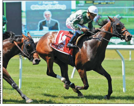
Mark My Way