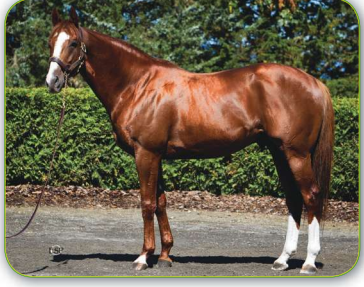
FROST GIANT Giant's Causeway-Takesmybreathaway Top 10 3rd Crop Sire by cumulative earnings in North America, 2.46 AEI $10,000 Live Foal

Afleet Alex-Classy Mirage First foals averaged nearly 7X the stud fee. First yearlings sell this summer. $7,500 Live Foal