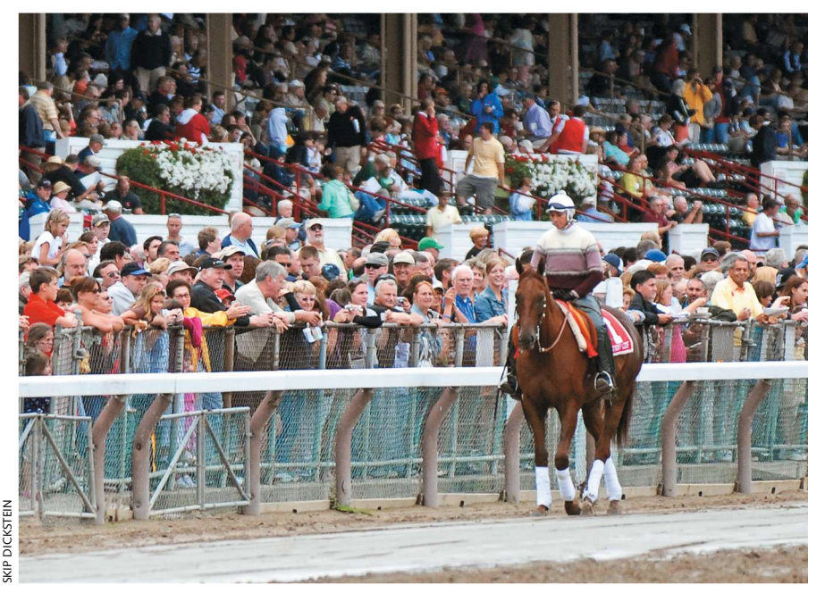
Funny Cide parades at Saratoga during his 'retirement party' in 2007

In August 2012, a statue of Funny Cide was unveiled in Saratoga. On his saddle towel is the number 6, his saddle towel number when he won the Kentucky Derby. 🗖