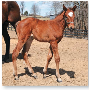
America's Lady filly