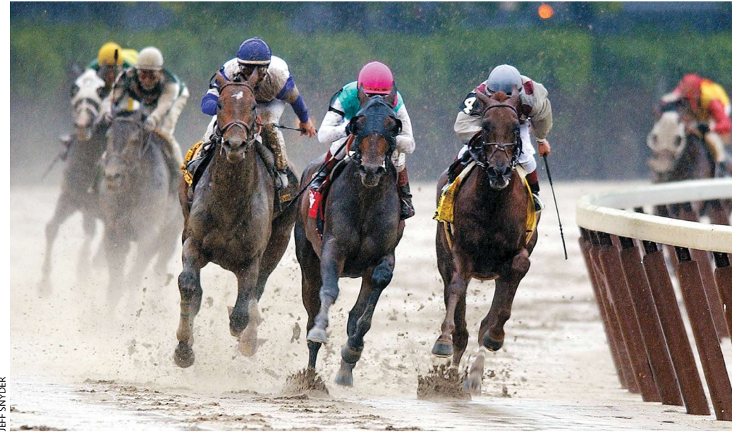
On the rail in the Belmont, Funny Cide ends up third in his bid for the Triple Crown