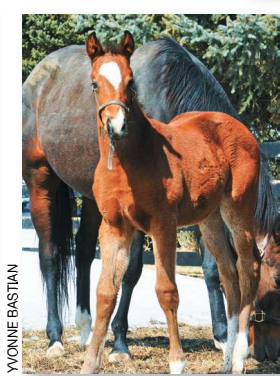
Loving Redemption colt