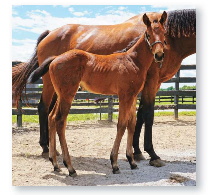
Real Shenanigans filly