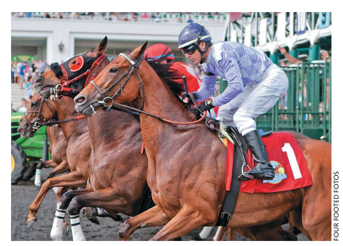
Synthetic surface specialist Flipcup breaks from the rail in the Arlington Matron

Flipcup was foaled at Waldorf Farm near North Chatham. She is out of the Touch Gold mare Dream Affair. Team Penney Racing purchased Dream Affair for $11,000 at the 2007 Ocala Breeders' Sales Co.'s winter mixed sale. Dream Affair delivered a colt by Cross Traffic earlier this year.