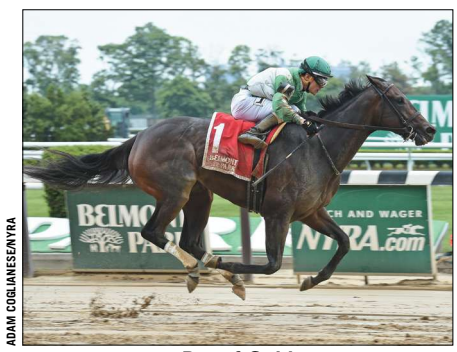
Bar of Gold