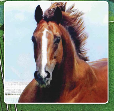
STONESIDER by Giant's Causeway | $3,500