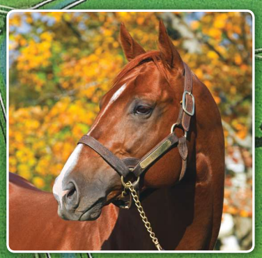
DUBLIN by Afleet Alex | $2,500