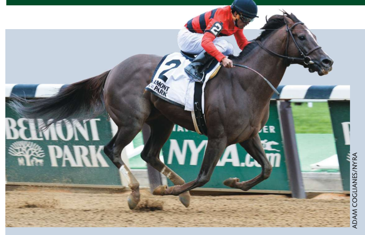
Weekend Hideaway winning the Affirmed Success