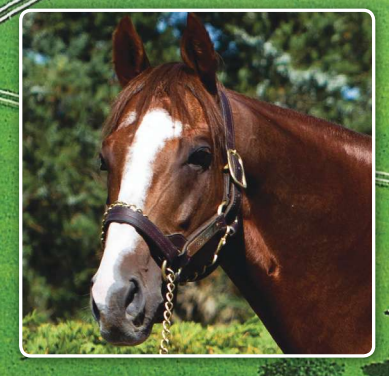
FROST GIANT by Giant's Causeway | $7,500