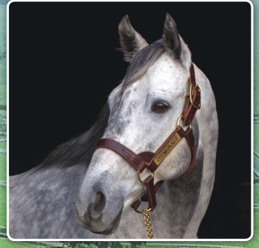
COSMONAUT by Lemon Drop Kid | $5,000