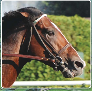
AL KHALI by Medaglia d'Oro | $2,500