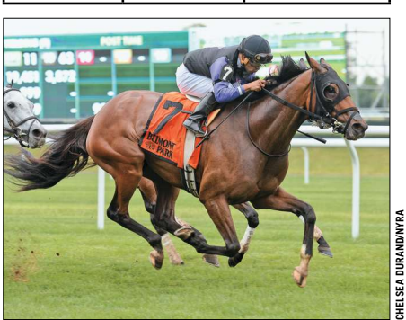
The Tea Cups