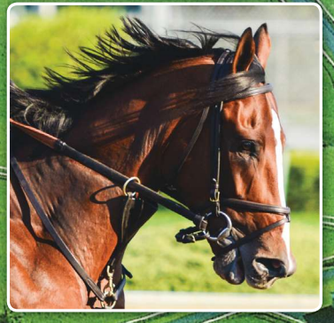
NORMANDY INVASION by Tapit | $5,000