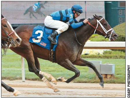
Swing and Sway