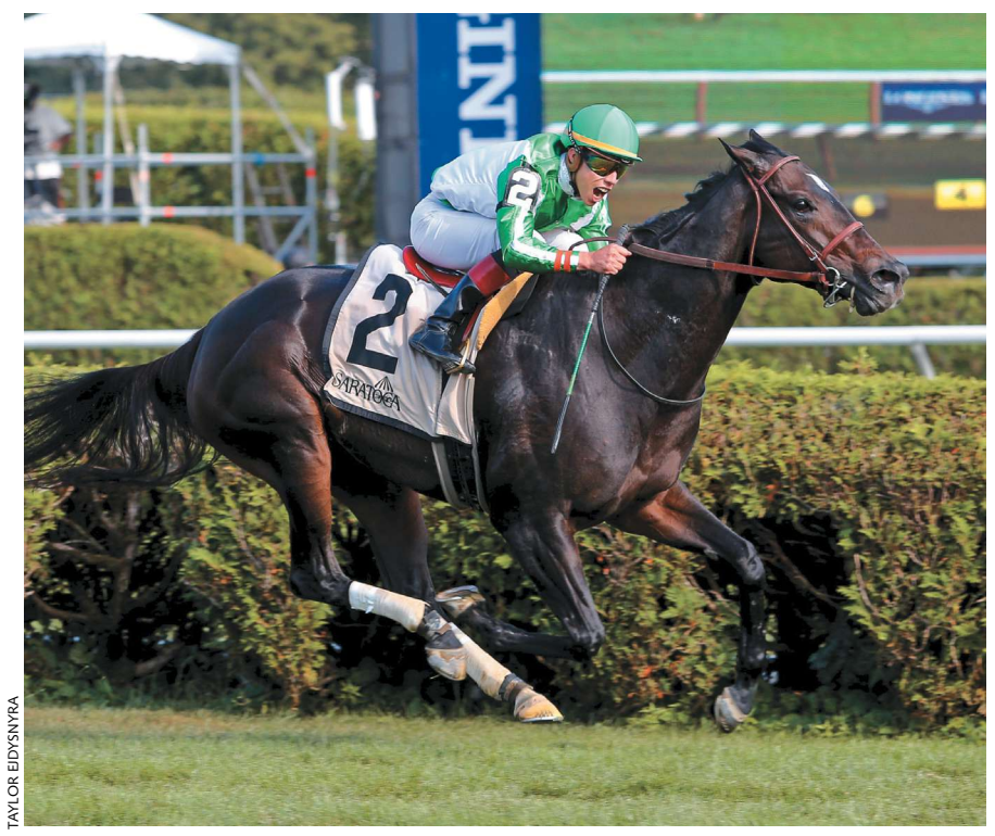
Bar of Gold winning the Yaddo Stakes at Saratoga

Bar of Gold has been retired after racking up a 7-6-4 slate in 25 starts and earning $1,551,000.