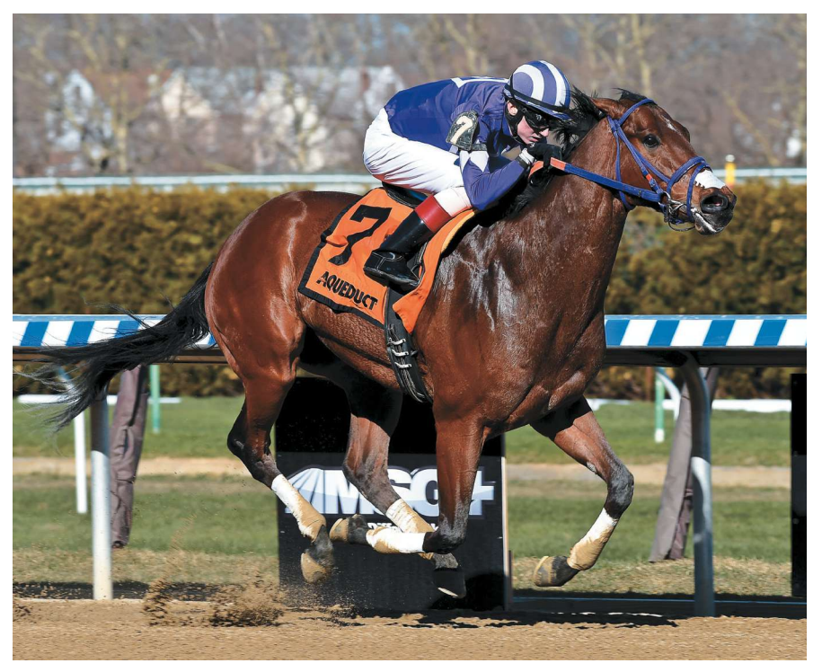
Retonova, racing for My Purple Haze Stables, wins the Times Square

"He ran such a great race for me, and after I won the first time with him (March 17 at Aqueduct), I called my