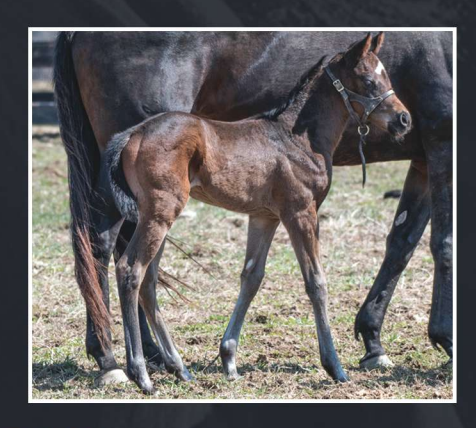
E STORM - 4/2 - FILLY - MARE BRED BACK