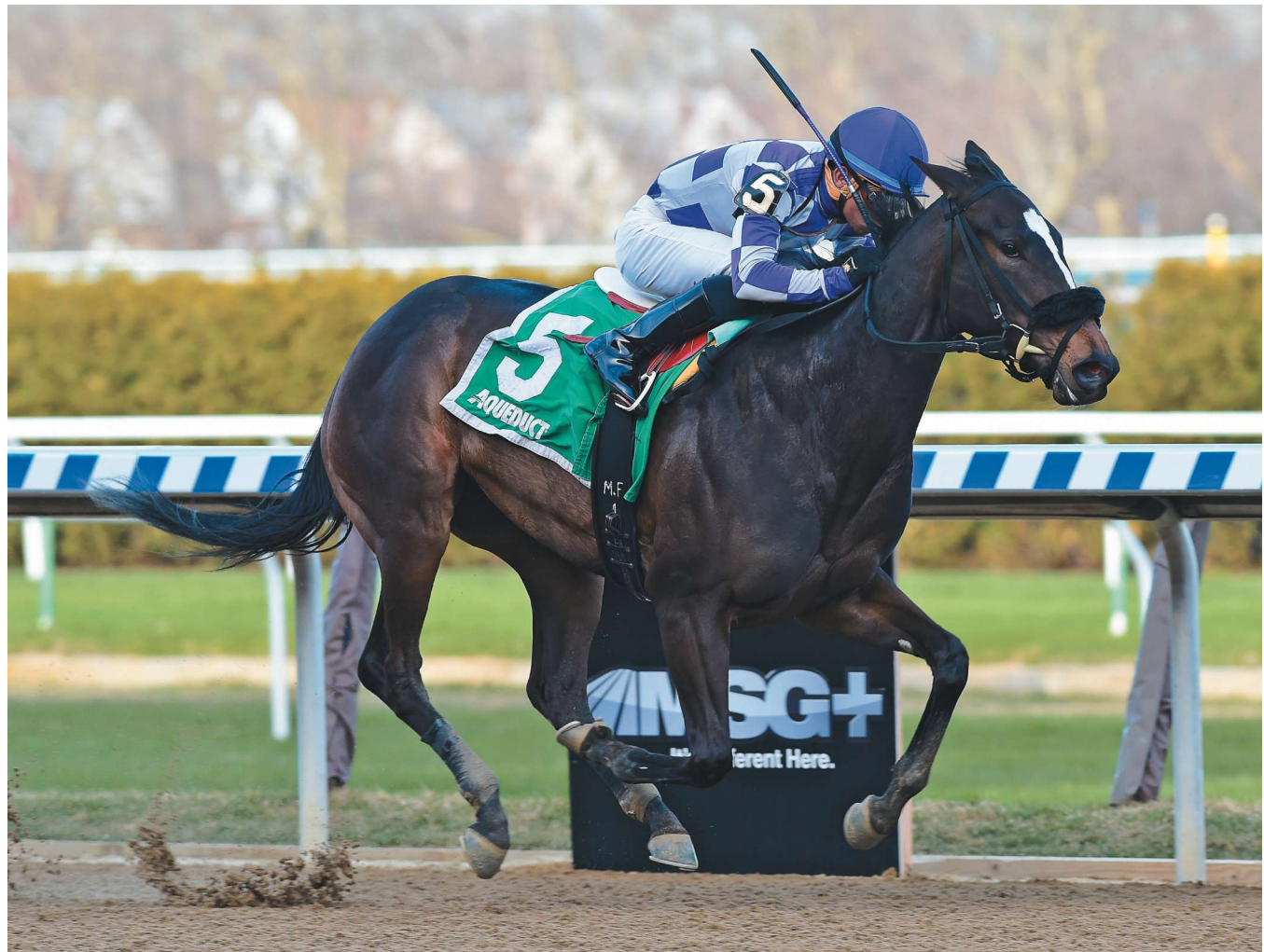
Baby Boss upsets the Park Avenue at 23-1

Stallion series swept by Englehart-trained sophomores