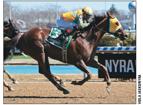
My Won Love