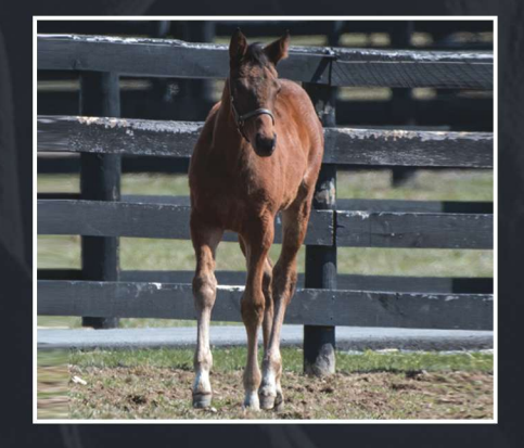
KIMONO - 1/28 - FILLY - MARE BRED BACK