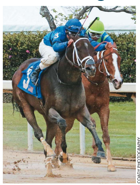
Swing and Sway

selves able to win at racing venues ed Time mare Placerita, and is a half anywhere. For New York-bred Swing sister to graded stakes winner Sticksand Sway, her place in the sun is Oak- statelydude (by First Dude), and mullawn Park in Hot Springs, Ark. The tiple stakes winner Saturday Nite Ride daughter of Macleans Music, bred by (by Flower Alley). At age 21, Placerita Canyon Lakes Thoroughbreds, won delivered a filly by Not This Time earthe $147,000 Carousel Stakes April 6, marking her second win in four starts at Oaklawn's boutique meet.