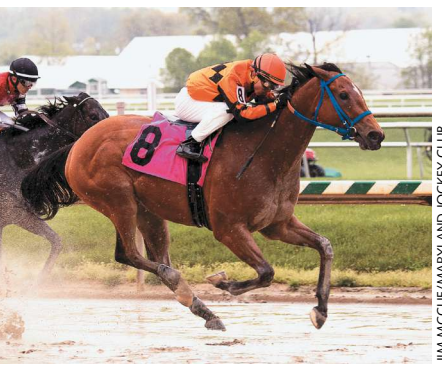
Absatootly proves best in the Primonetta