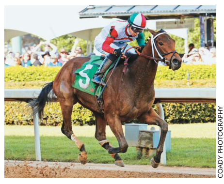
Oaklawn H. winner Inside Straight

The 4-year-old filly had previously shown an affinity for Laurel, winning open allowance races there in March 2016 and this February. In New York she won the $100,000 East View Stakes in December 2015. She's also stakes-placed at Belmont, Finger Lakes, and Mahoning Valley Race Course in Ohio.