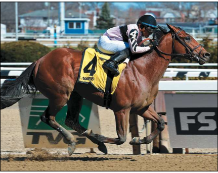
Long Haul Bay

2005: Tiz T'was, b f, by Tiznow. Raced 2 yrs, 4 sts, 0 wins, $2,832. 2005: Tiz T'was, b f, by Tiznow. Raced 2 yrs, 4 sts, 0 wins, $2,832. Dam of 5 foals, 4 rnrs, 2 wnrs. ($450,000 barmay 2vo)