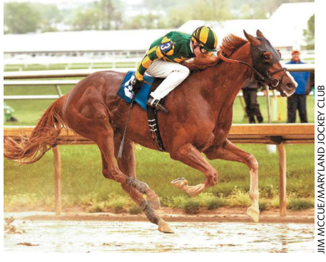
Twisted Tom may try the Preakness next