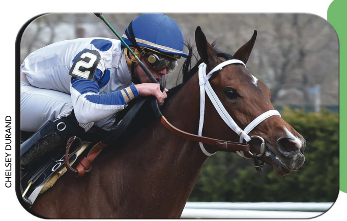
NY-Bred ONE LAST CAST Winner of the $100,000 Astoria Trial A for 2yo Filles

earned in purse money, awards and bonuses in her career debut!