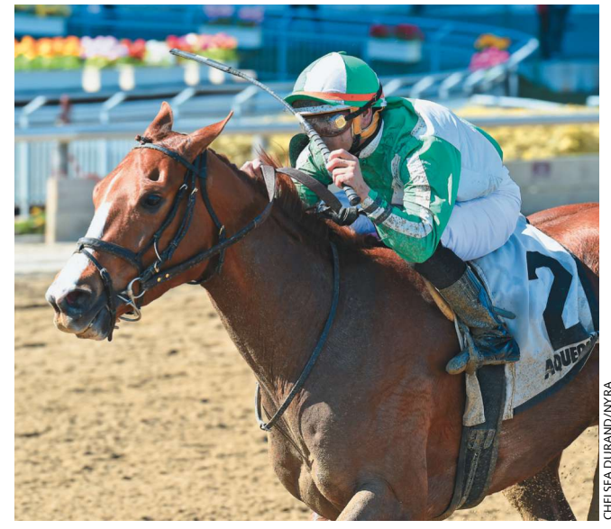
Highway Star takes Aqueduct's Distaff Handicap

New York-breds stepped way out into open company during April and brought home some of racing's biggest prizes. Five graded stakes, from Gulfstream, to Oaklawn, to Aqueduct were won by state-breds, and two others appear headed to the Preakness Stakes (G1), the second jewel of the Triple Crown.