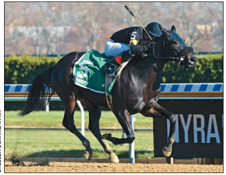
I Still Miss You

Lifetime: 6 crops, 716 foals, 524 rnrs (73%), 366 wnrs (51%), 103 2yo wnrs (14%), 27 sw (4%), 1.27 AEI, 1.34 CI, 316 sale yrlgs, avg $44,146, 0.7 TNA.