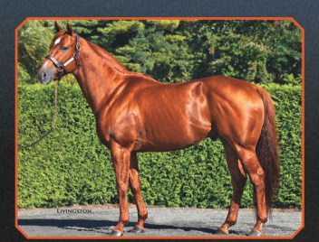
D' Funnybone By D'wildcat $2,500 No. 3 Third-Crop Sire in NY