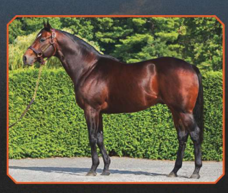
Giant Surprise By Giant's Causeway $4,000 AEI 2.21, Highest in New York