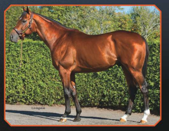
Micromanage By Medaglia d'Oro $4,000 1st weanlings $30,000, $25,000, etc.