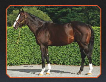
Soaring Empire By Empire Maker $2,500 Third Leading NY 2nd-Crop Sire