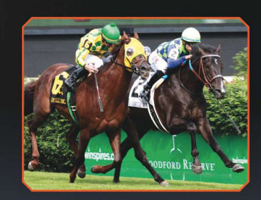
War Dancer By War Front $7,500 First Foals in 2018