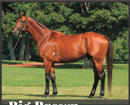
Big Brown BOUNDARY X MIEN $6,000 STUD FEE

Bellamy Road CONCERTO X HURRY HOME HILLARY $6,000 STUD FEE