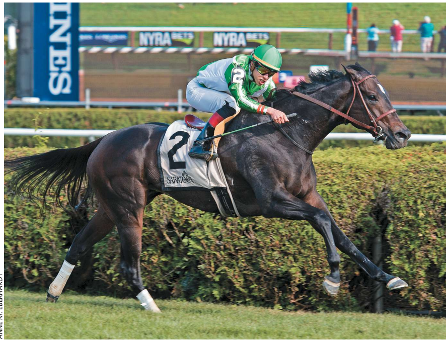
Bar of Gold wins the Yaddo Stakes at Saratoga