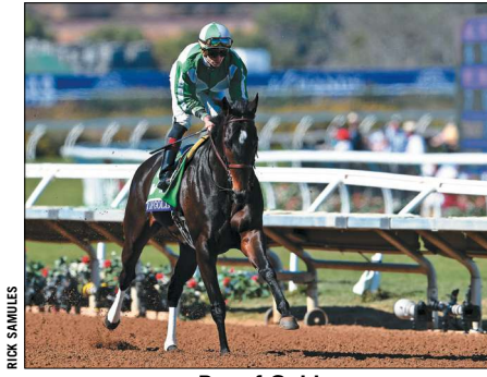
Bar of Gold