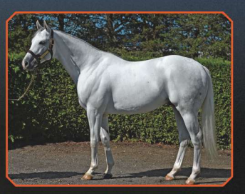
Honorable Dillon By Tapit $5,000 1st 2YOs in 2018