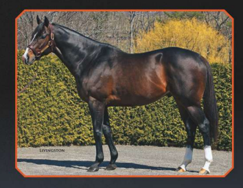
Trinniberg By Teuflesberg $3,500 Eclipse Champion Sprinter