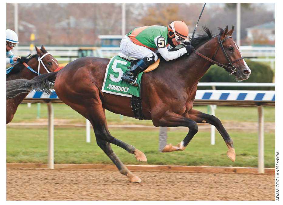
Waterville Lake Stables' homebred Sea Foam, by Medaglia d'Oro, wins the Notebook