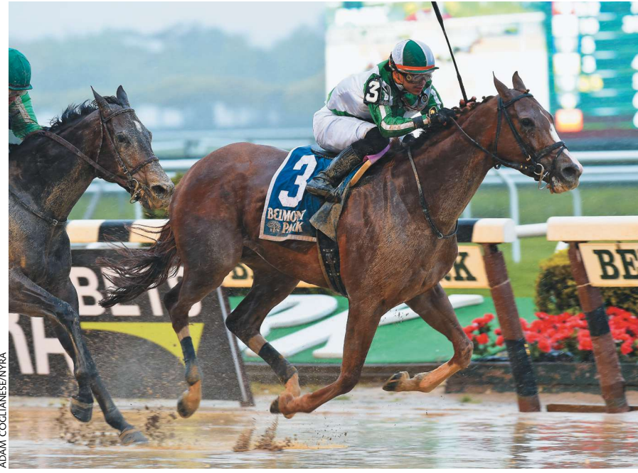
Highway Star splashes home to take the Ruffian Stakes (G2) at Belmont Park