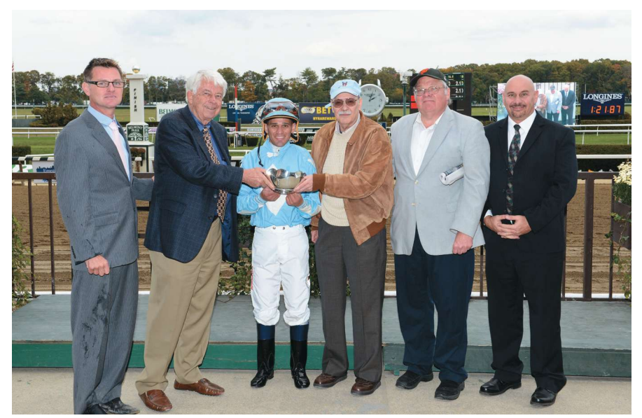
A cluster of New York stars gather in the winner's circle after Turtle Bird Stable's Cluster of Stars, left, rolled in the Iroquois Stakes

was being geared down late by jockey Javier Castellano.