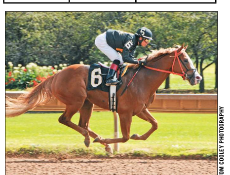
Sing the Dream