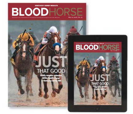
BloodHorse weekly magazine & tablet