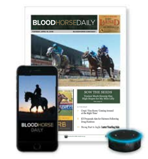
Free BloodHorse Daily PDF, BloodHorse Daily app and listen on your Alexa device