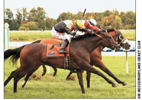
Fire Key (inside)