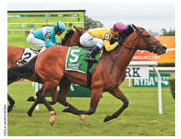
Fourstar Crook has earned more than $1.3 million