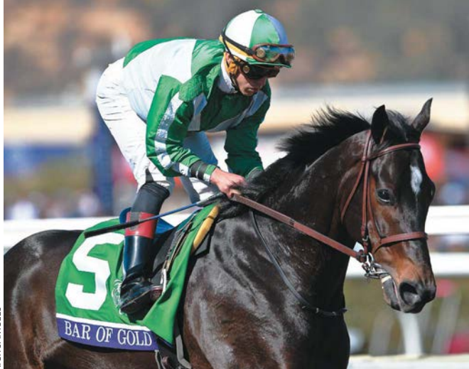
Bar of Gold is also a Breeders' Cup winner