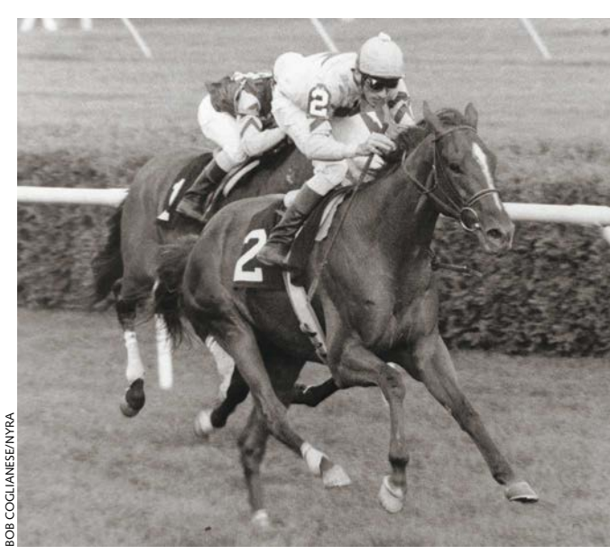
Full brothers Fourstars Allstar (above) and Fourstardave are both on the all-time list