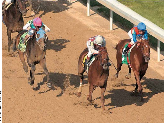
Funny Cide winning the 2003 Kentucky Derby