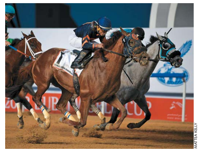
Mind Your Biscuits, outside, takes this year's Golden Shaheen

THE NATIONAL RACING SPOTLIGHT focused on a pair of uber-talented New York-breds Aug. 4 in the 91st edition of the $1.2-million Whitney Stakes (G1)—multiple graded stakes winners Diversify (by Bellamy Road) and Mind Your Biscuits (by Posse).