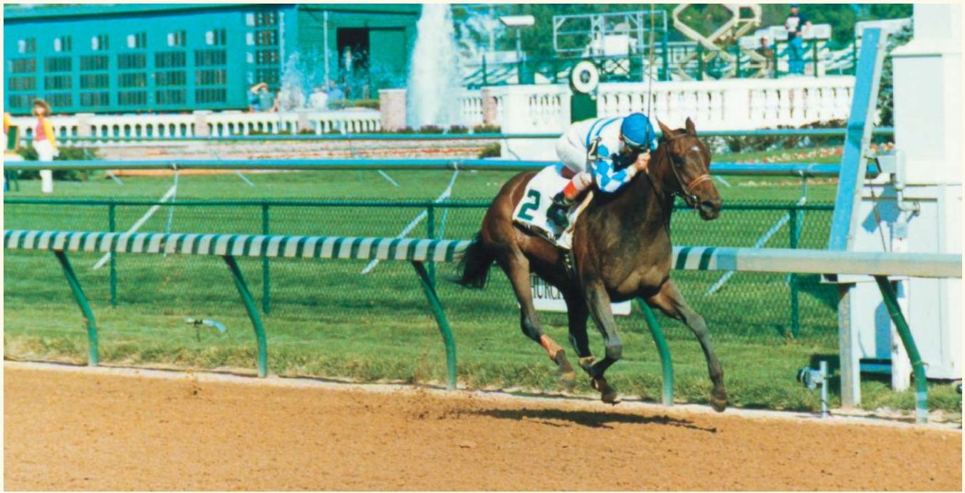
Buryyourbelief pulls off an 8-1 upset in the 1987 Kentucky Oaks at Churchill Downs

Ballindaggin (1985; Noble Nashua-Can't Be Bothered, by Stop the Music)