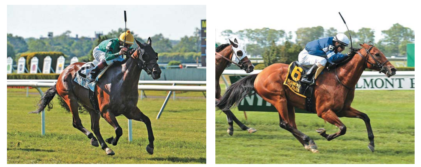
Kingston Trio: King Kreesa, above, Lubash, right, and Kharafa, lower left, are all winners of the Kingston Stakes

Currently, 50 New York-breds have career earnings of $1 million or more.