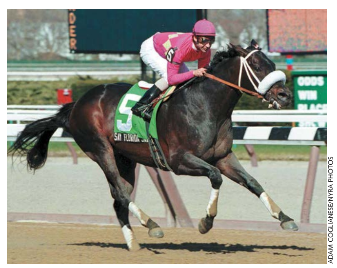
Say Florida Sandy raced over seven seasons