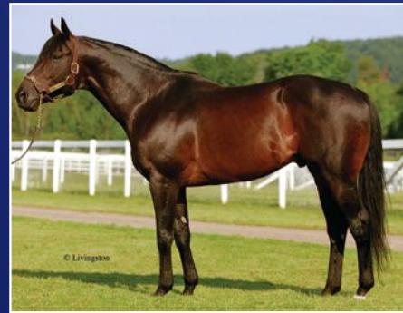
WESTERN EXPRESSION Gone West - Tricky Game A perennial leading NY sire with 16 stakes horses and winners of over $10,000,000

Foaling | Breeding | Boarding | Sales Prep | Lay-ups