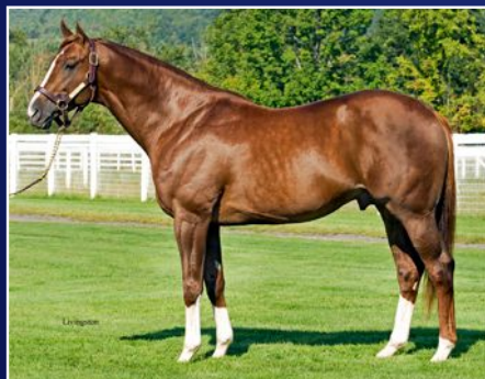
STONESIDER Giant's Causeway - Added Gold A leading sales sire with both crops Look for first 2YOs, they're getting rave reviews