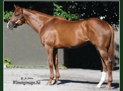
DUBLIN $8,500 Aflet Alex-Classy Mirage