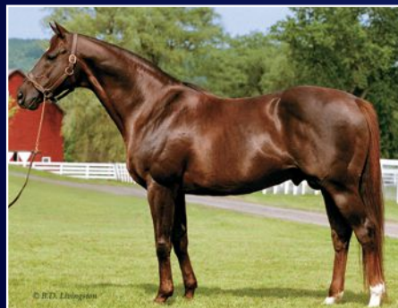
KEY CONTENDER Fit to Fight - Key Witness NY's leading active sire by percentage of 2010 stakes winners from starters