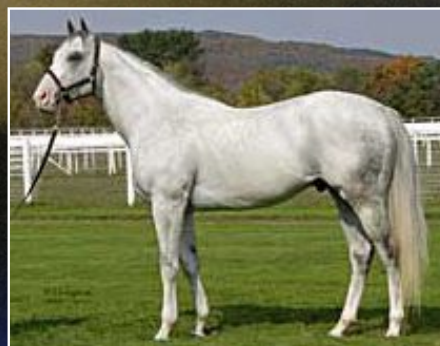
MAYBRY'S BOY Broad Brush - Aly's Conquest Sire of 2YO Saratoga winner SPORTSWRITER from first crop