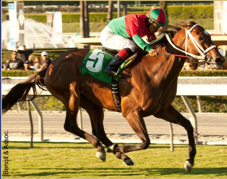
Benoit & Assoc.