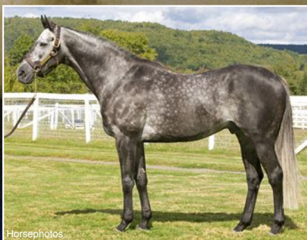
COSMONAUT Lemon Drop Kid - Cosmic Fire Multiple Graded Stakes Winning Millionaire First foal are out of this world!