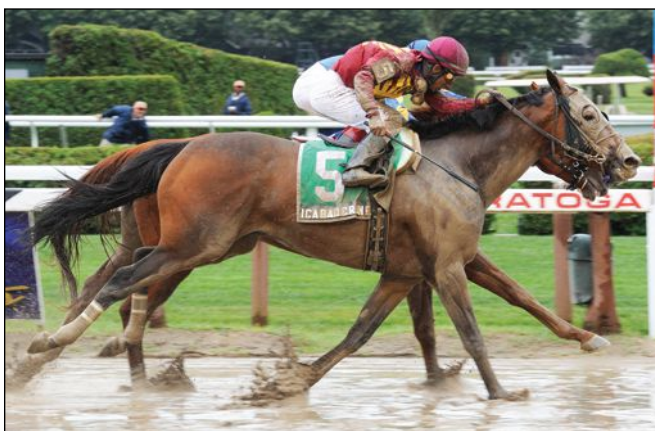
ICABAD CRANE WINS THE EVAN SHIPMAN STAKES