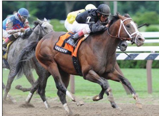
IBBOYYEE TAKES THE JOHN MORRISSEY STAKES

Both Ibboyyee and Icabad Crane certainly were due for