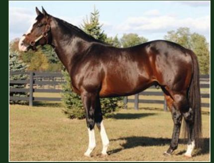
FREUD | $8,500 Storm Cat-Mariah's Storm