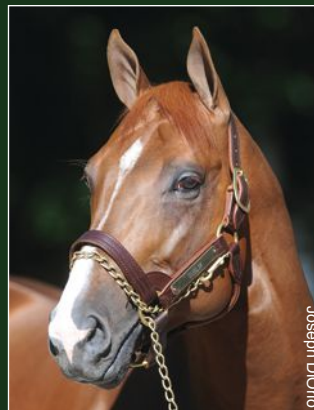
DUBLIN $8,500 Aflect Alex-Classy Mirage

KEANE STUD is proud to welcome DUBLIN , owned by Spendthrift Farm, to our 2012 stallion roster.