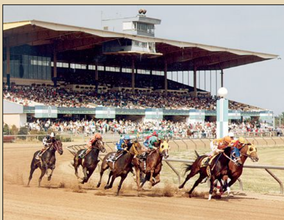
Finger Lakes photo

By statute, Finger Lakes will receive 60% of the money, or $492,000. NYRA's share totals $328,000. The budget revision resulted from increased revenues