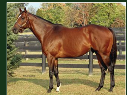
READ THE FOOT NOTES $6,000 Unbridled's Song-In the Storm

BOARDING / BREEDING / FOALING / LAY-UPS / SALES PREP