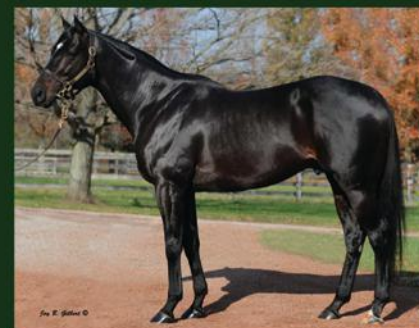
NOONMARK | $6,000 Unbridled's Song-In the Storm