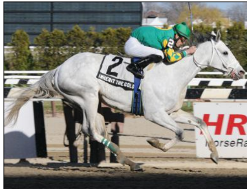
INHERIT THE GOLD Gold Token gelding wins Excelsior by 6\frac{1}{4} lengths

The Hoopers were having their problems as well. They had