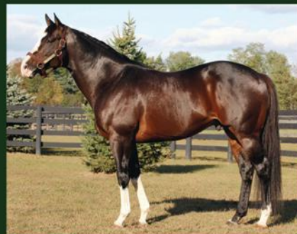
FREUD | $8,500 Storm Cat-Mariah's Storm