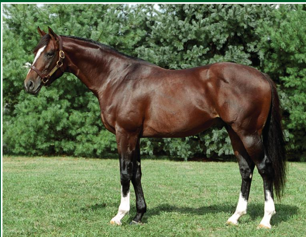
BARBARA D. LIVINGSTON

CURRENT LEADING NEW YORK SIRE WITH 52% WINNERS/STARTERS TOP NY SIRE BY EARNINGS/STARTER WITH $61,199 79% WINNERS/STARTERS LIFETIME RANKS AMONG TOP 1% OF ALL SIRES BY A.E./START