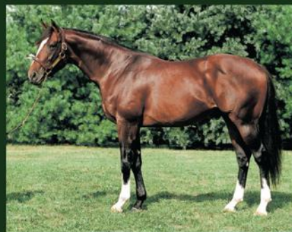
DISCO RICO | $5,000 Citidancer-Round It Off

Congratulations to all their connections!