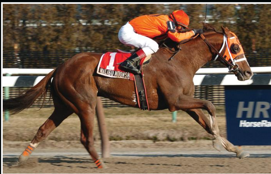
Brandon Benson photo