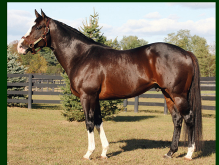
FREUD | $8,500 Storm Cat-Mariah's Storm