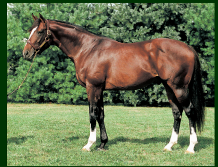
DISCO RICO | $5,000 Citidancer-Round It Off