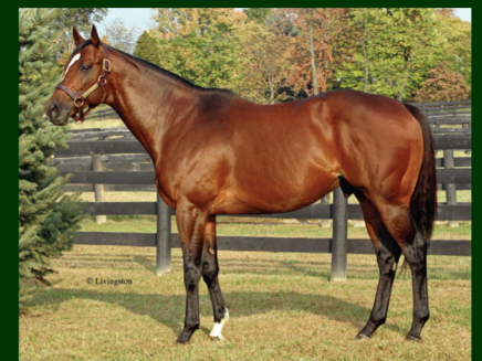
READ THE FOOTNOTES $6,500 Smoke Glacken-Baydon Belle