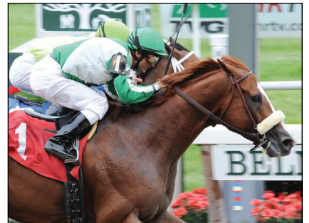
FRIEND OR FOE

Margins: head, 5/4, 2 1/4. Also ran: Tahitian Warrior 120 ($3,000).