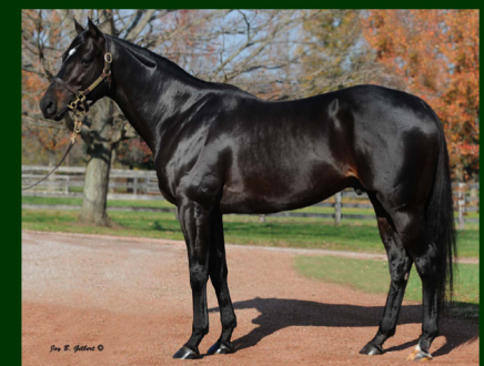
NOONMARK | $6,000 Unbridled's Song-In the Storm