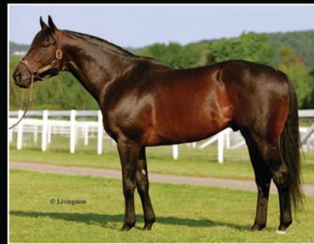
WESTERN EXPRESSION | $5,000 Gone West - Tricky Game A perennial leading NY sire with 16 stakes horses and 13% winners of over $100,000.

Breeding | Boarding | Sales Prep | Lay-Ups