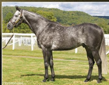
COSMONAUT | $5,000 Lemon Drop Kid - Cosmic Fire Multiple Graded Stakes Winning Millionaire & his sire's leading son at stud.