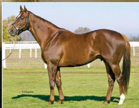
CONGAREE | $7,500 Arazi - Mari's Sheba Sired the #1 Yearling by a 2010 NY Sire, $95,000 filly KeeSept