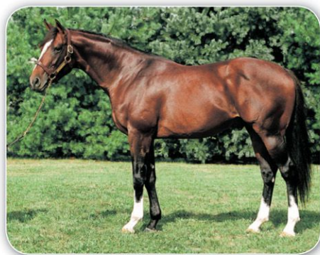
DISCO RICO | $5,000 Citidancer-Round It Off

Our 275 limestone-rich acres and state-of-the-art facilities in the heart of the Hudson Valley make us uniquely able to serve existing New York horsemen and those who wish to expand into the state.