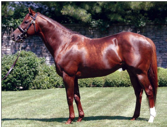
Lion Heart stood at stud in Kentucky until being sold to Turkey

A month after losing Lion Heart, Lizza fell in love again—this time with a filly named Salty Romance at the Ocala Breeders' Sales Co. March selected two-year-olds in training sale. The