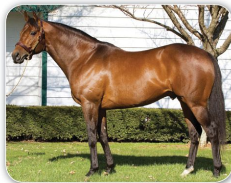
ONE NICE CAT | $1,000 Storm Cat-Jewel Princess