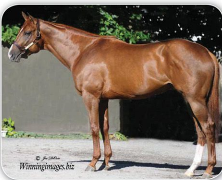
DUBLIN | $7,500 Afleet Alex-Classy Mirage