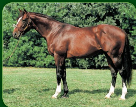
DISCO RICO | $5,000 Citidancer-Round It Off

Our 275 limestone-rich acres and state-of-the-art facilities in the heart of the Hudson Valley make us uniquely able to serve existing New York horsemen and those who wish to expand into the state.