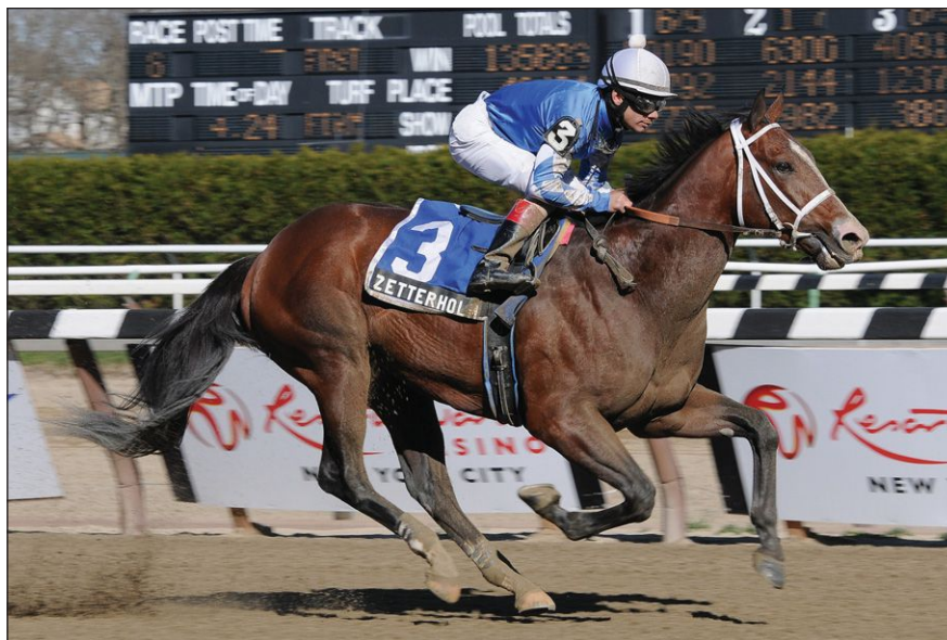
Zetterholm is one of four stakes winners for his dam