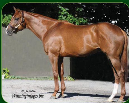
DUBLIN | $7,500 Afleet Alex-Classy Mirage