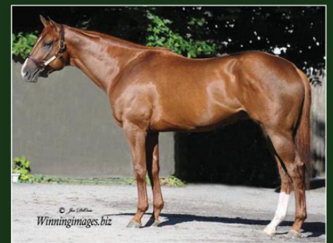
DUBLIN $7,500 Aflect Alex-Classy Mirage

BOARDING / BREEDING / FOALING / LAY-UPS / SALES PREP