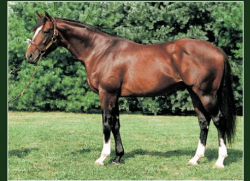
DISCO RICO | $5,000 Citidancer-Round It Off