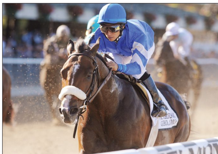
GIROLAMO TO SEQUEL STALLIONS

"We are proud to offer New York breeders this outstanding facility, which already is the home of 18 graded stakes win-