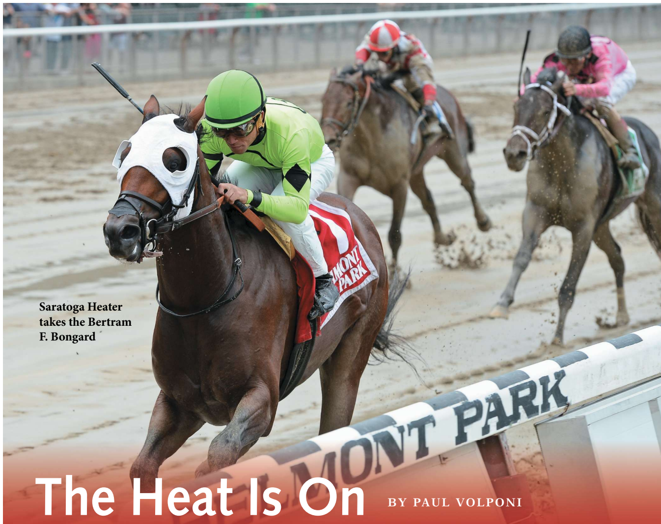
Saratoga Heater takes the Bertram F. Bongard