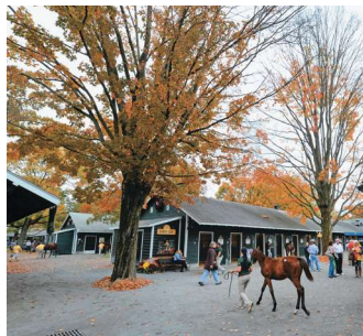
This year's fall mixed sale has a two-day format and includes 107 yearlings

And a lot of those weanlings are being pinhooked into the following year's preferred yearling sale. Over the last two years 40 weanlings have been purchased—at an average price of $26,525—at the fall mixed sale that made their way back to the sale grounds the following August. In 2013 those yearlings averaged $76,846 and this year