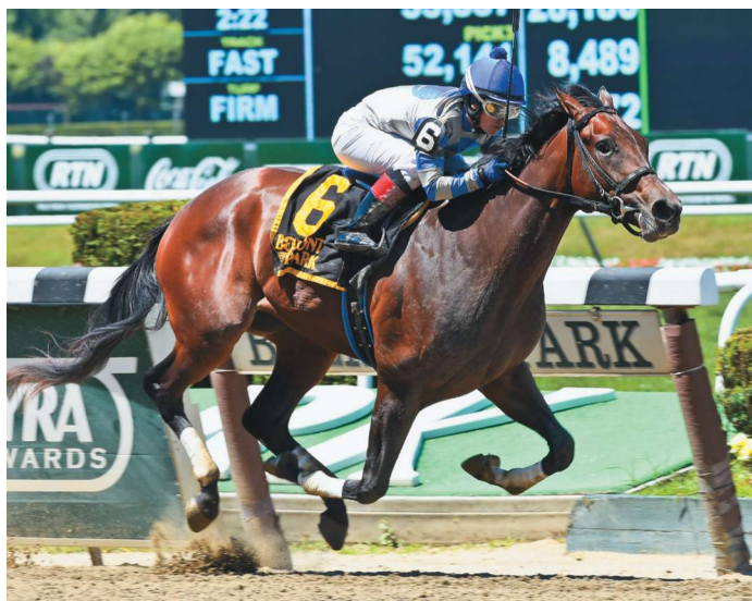
Treadway's Wonder Gal winning the Lynbrook Stakes in July

"That year we spent more money," he went on, "and we've upgraded quality over the years—we kind of went for it a little bit more. But you never know. Even if you spend a little bit more, it's less than a lot of other people, and to find that one horse, to get that diamond in the rough—you just never think you'll do that."