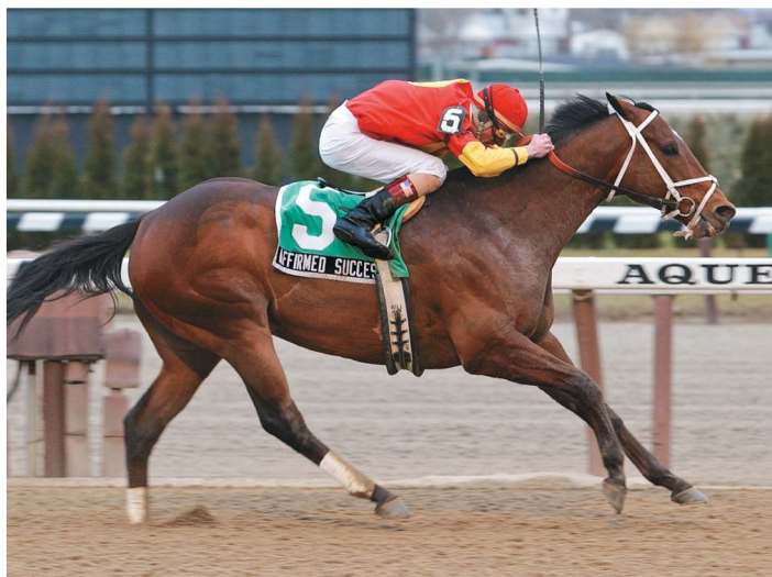
Affirmed Success won 10 stakes with nine of them coming at New York Racing Association tracks