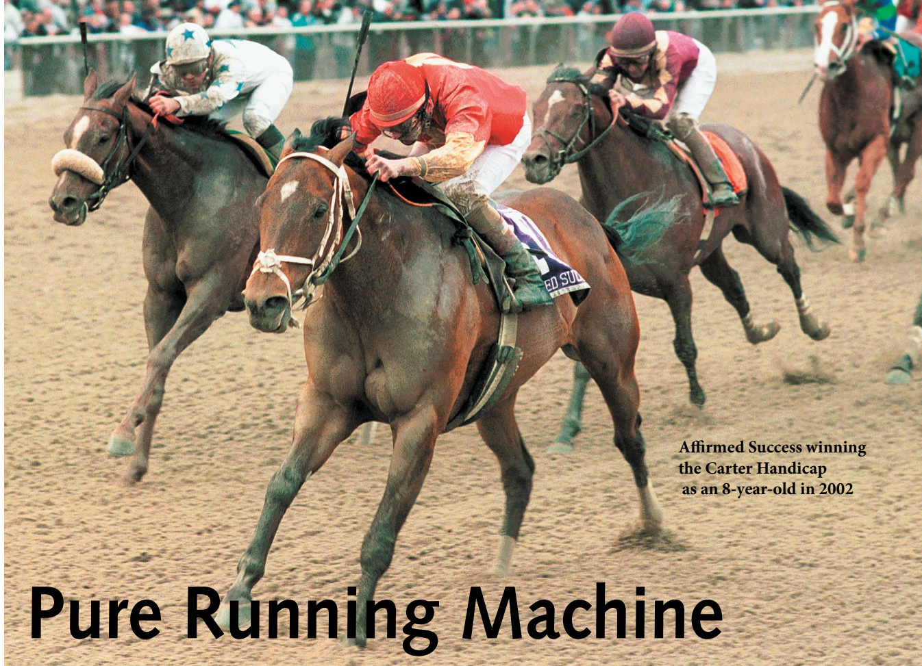
Affirmed Success winning the Carter Handicap as an 8-year-old in 2002