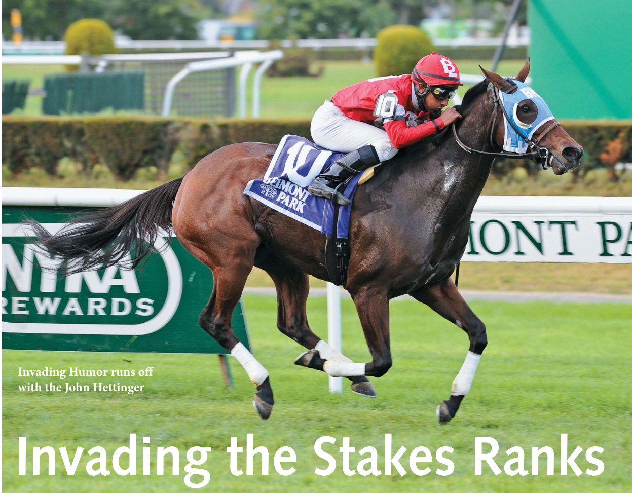
Invading Humor runs off with the John Hettinger