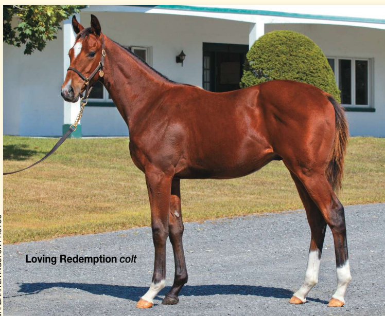
Loving Redemption colt

Visit our new site www.dormellitostud.com for more about Simmard!