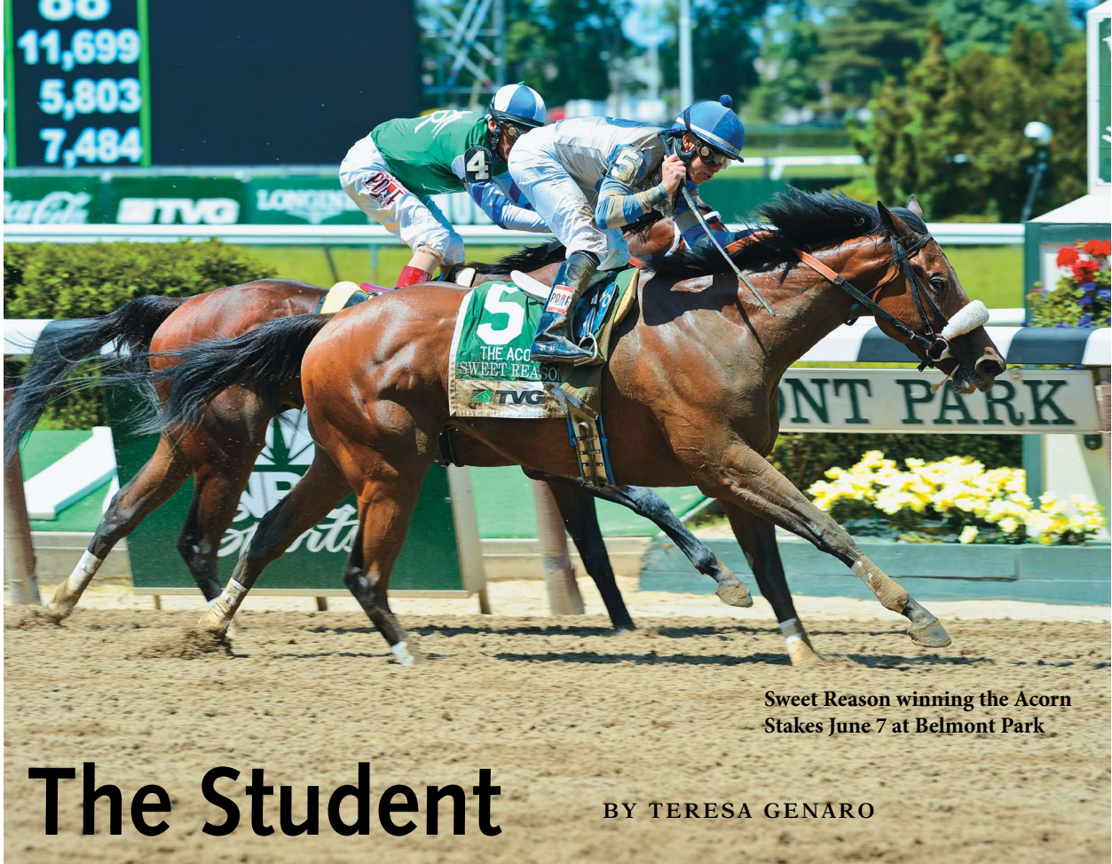
Sweet Reason winning the Acorn Stakes June 7 at Belmont Park