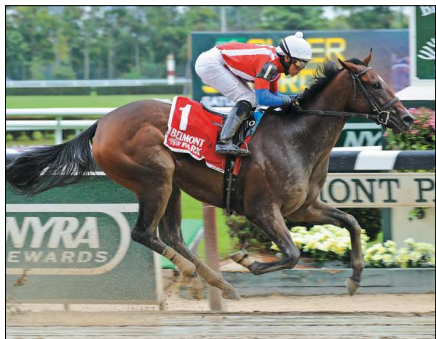
Temper Mint Patty