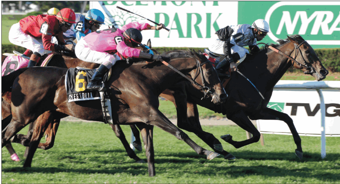
YOU GO WEST GIRL WINNING JOHN HETTINGER STAKES Mr. Greeley filly carries blood of Raise a Native in both halves of her pedigree