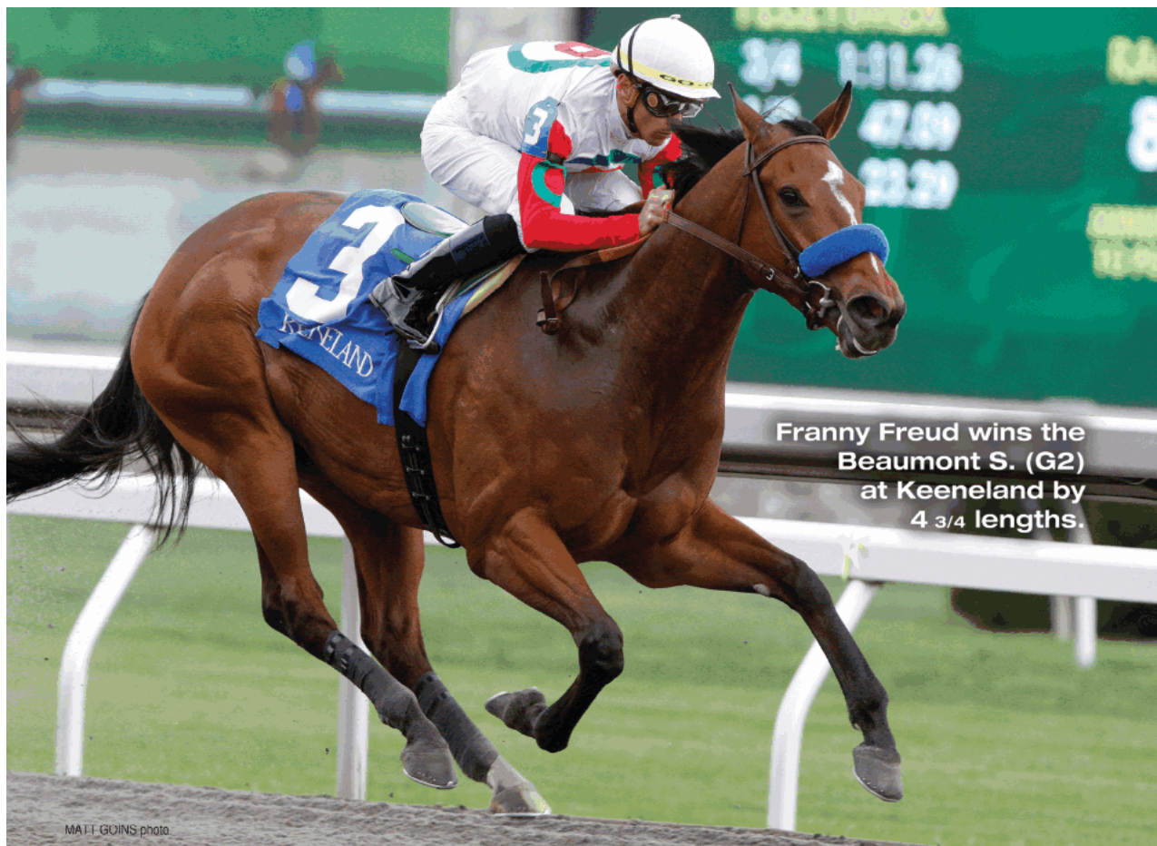
Franny Freud wins the Beaumont S. (G2) at Keeneland by 4 3/4 lengths.