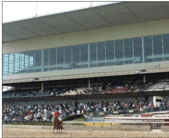
AQUEDUCT ON HOLD Efforts to bring VLTs to the track and $1-million a day in revenue to the state are stalled in Albany

With money—for New York City OTB, the New York Racing Association, and New York breeders— as a key concern, the Aqueduct VLTs take on even greater significance. The money also is vital to the state, which has a projected $2-billion deficit.