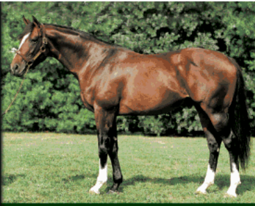
DISCO RICO Citidancer-Round It Off • $5,000