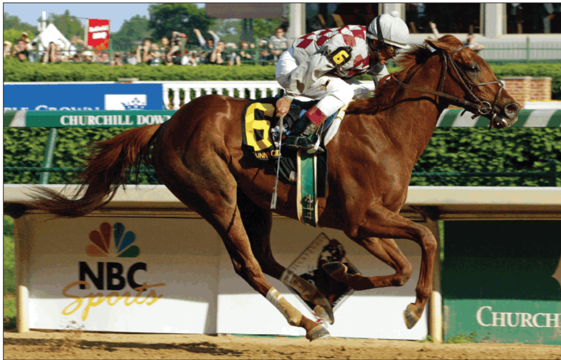
Funny Cide's victory in the 2003 Kentucky Derby put New York breeding on the map