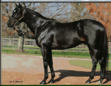
NOONMARK Unbridled's Song-In the Storm • $6,000