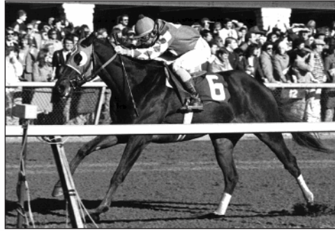
D'ACCORD WINNING THE 1981 BREEDERS' FUTURITY Firestones' homebred draws away to a 7½-length victory

North East Bound eventually scored ten stakes victories, seven on turf and three on dirt. In an exceptional 2000 season, he was a Grade 2 winner on dirt, a Grade 3 winner and record-setting miler (1:33.42) on turf, and missed by a neck in the Breeders' Cup Mile (G1).