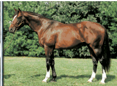
DISCO RICO Citidancer-Round It Off • $5,000