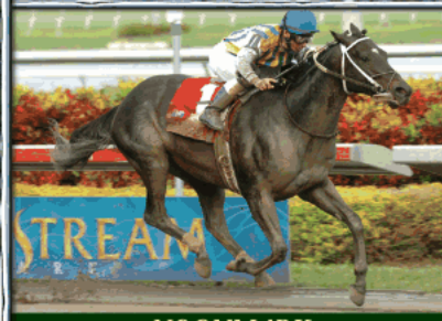
NOONMARK Unbridled's Song-In the Storm • $6,000