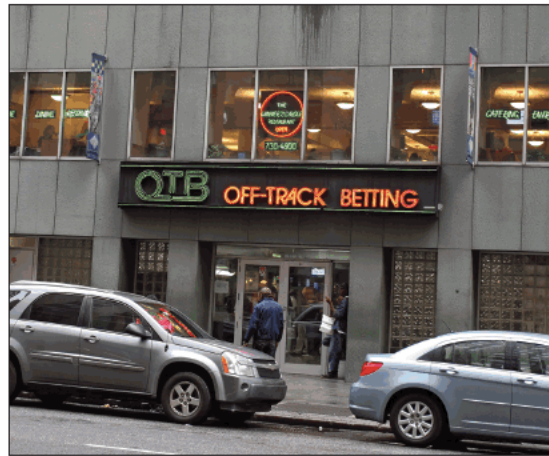
NEW YORK CITY OTB WILL DOWNSIZE Marginal betting parlors are expected to close

In announcing its Chapter 9 filing, New York City OTB said specifically that it will not seek reductions of its payments to the state and city. However, it raised the specter of closing if it does not receive relief from payments for its other mandated expenses. "Without this change, [New York City] OTB may be forced to cease operations, which would cause the city, the state, and horse racing industry to lose all revenues that could be provided