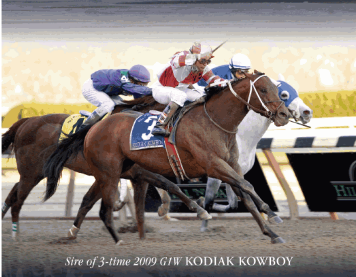
Sire of 3-time 2009 GIW KODIAK KOWBOY