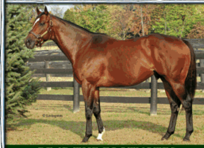
READ THE FOOTNOTES Smoke Glacken-Baydon Belle • $5,000