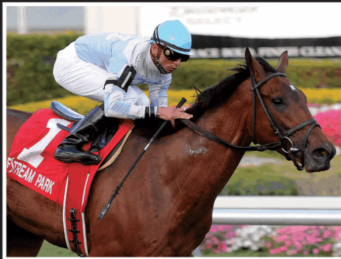
I LOST MY CHOO-G3