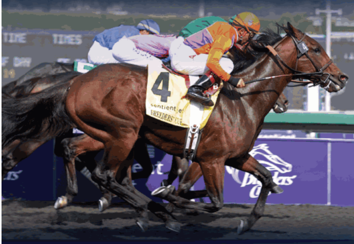
Sire of BC Sprint-G1 2nd CROWN OF THORNS