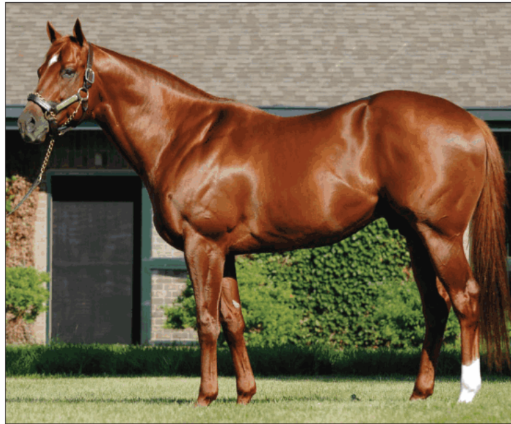
SPEIGHTSTOWN BLOSSOMS AT AGE 6 Eclipse Award winner as champion sprinter, he has made a successful start at stud

The brilliant Pico Central (Brz) beat Speightstown in the Vosburgh Stakes (G1) but was not entered in the Breeders' Cup Sprint (G1) at Lone Star Park. Speightstown outgunned Kela down the lane to win the Sprint and the Eclipse Award that usually goes with it. The Breeders' Cup victory concluded