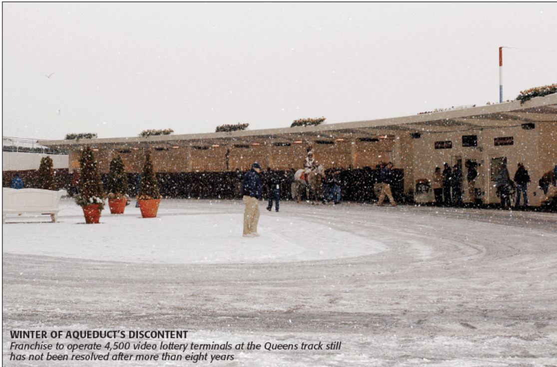
WINTER OF AQUEDUCT'S DISCONTENT Franchise to operate 4,500 video lottery terminals at the Queens track still has not been resolved after more than eight years