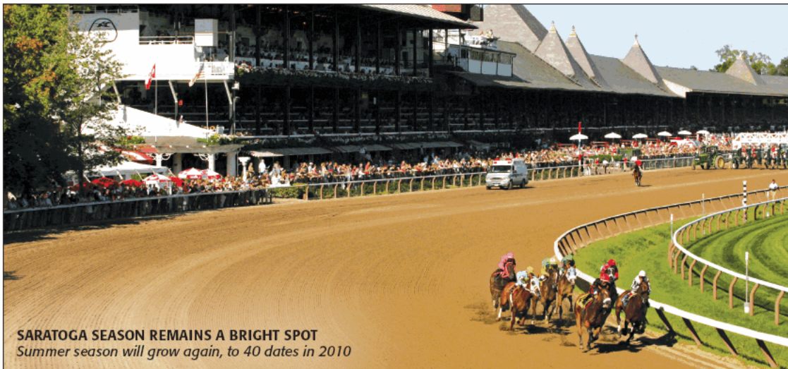
SARATOGA SEASON REMAINS A BRIGHT SPOT Summer season will grow again, to 40 dates in 2010