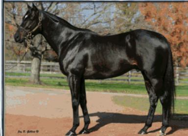
NOONMARK Unbridled's Song-In the Storm • $6,000