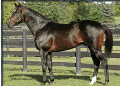
HOOK AND LADDER Dixieland Band-Taianna • $5,000