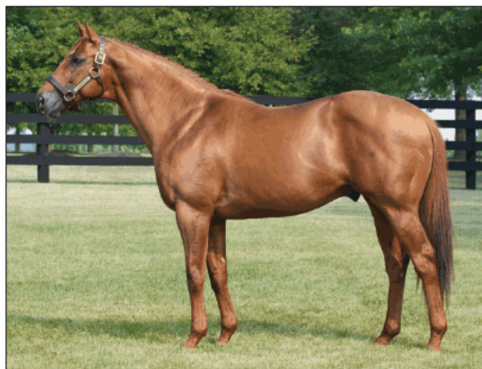
GOLDEN MISSILE Sires earners of more than $2.8-million

King Cugat, a Kingmambo horse who last stood at Liberty Stud,