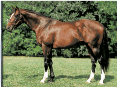
DISCO RICO Citidancer-Round It Off • $5,000