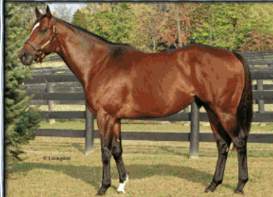
READ THE FOOTNOTES Smoke Glacken-Baydon Belle • $5,000