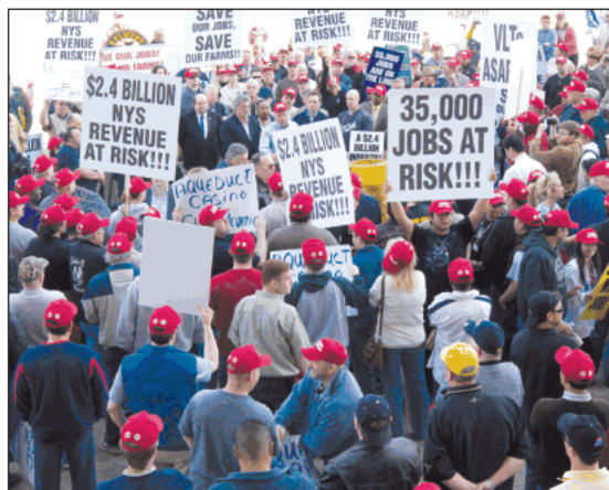
The March 21 rally at Belmont led to a boycott of the entry box for the first race at Aqueduct that day

"We have gathered here today to tell an entire generation of Albany leaders that we have no intention of dying, we have every intention of making our voices heard, and we have every intention of making sure they do their jobs so that we can do ours."