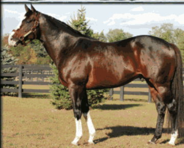
FREUD Storm Cat-Mariah's Storm • $6,500