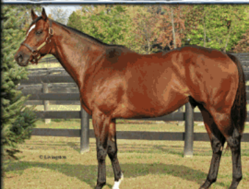
READ THE FOOTNOTES Smoke Glacken-Baydon Belle • $5,000