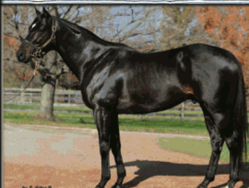
NOONMARK Unbridled's Song-In the Storm • $6,000