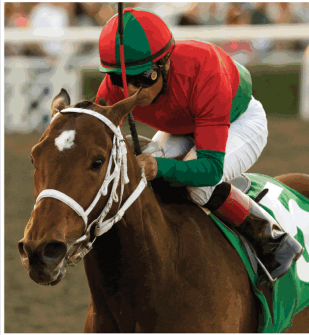
SHINE UPON - Undefeated 3YO filly & NY-Bred Stakes Winner