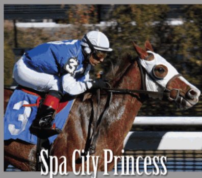
Spa City Princess

3/7 AQU - winner by 5 1/4 lengths, going away