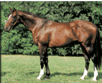
DISCO RICO Citidancer-Round It Off • $5,000